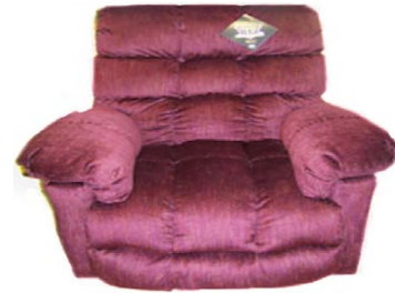
Brazil Recliner ( choice of 3 colors )