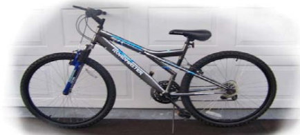
A Roadmaster 18 Speed, 26" Mountain Bike, Priced at $175.00